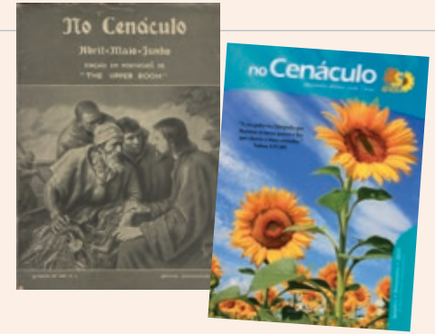
The original and current covers of the Portuguese-Brazil edition